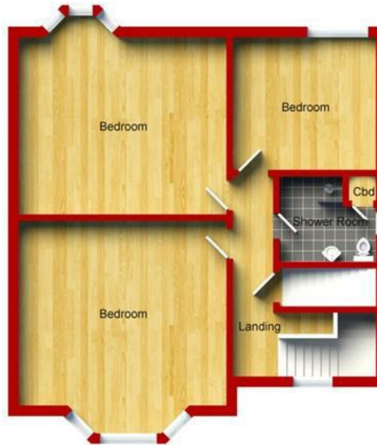
First Floor Approximate Floor Area (72.50 sq.m)