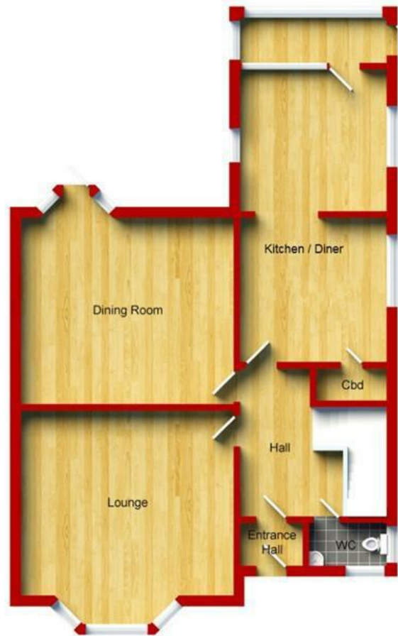
Ground Floor Approximate Floor Area (87.90 sq.m)