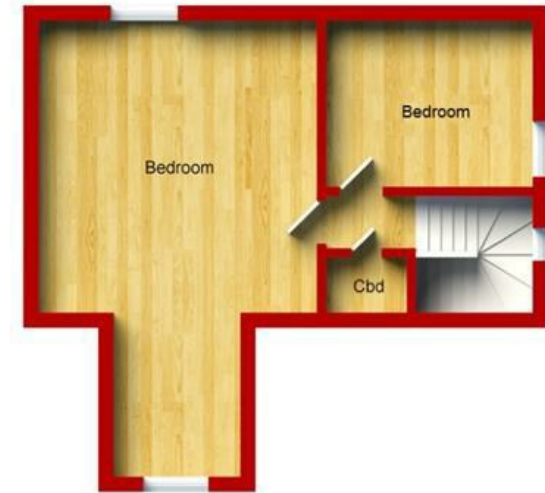
Top Floor Approximate Floor Area (43.80 sq.m)